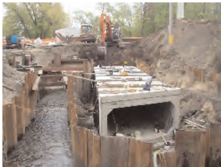
The City replaces the culvert at the mouth of Kids Creek which includes a unique baffle design that provides critical darting cover for younger age-class fish.